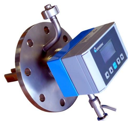
SONATEC HW Transmitter Version for the Wort Kettle