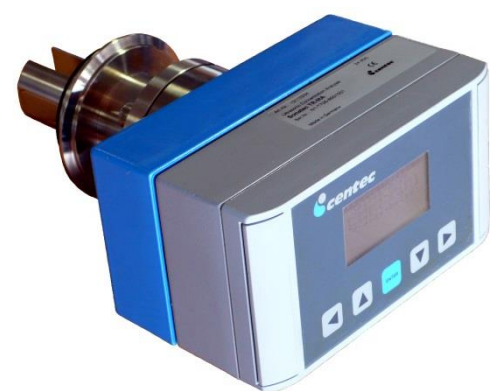
SONATEC Transmitter Version

SONATEC continuously measures the velocity of sound through liquids. Designed for applications that require maximum sensitivity and high accuracy, this device is used in various industries all around the world. Breweries and beverage manufacturers determine extract or dissolved sugar contents in-line with SONATEC. Equipped with an integrated cleaning nozzle, SONATEC HW can be installed directly into brewery wort kettles and evaporators. In numerous pharmaceutical and chemical applications SONATEC is used to control the concentration of acids, caustics and other solutions – but also for monitoring the quality of raw materials and final products. The instrument measures the speed of a sound pulse between a transmitter and a receiver. The sound pulse is created by piezo-elements and moves perpendicular to the product flow. As a specific property of each liquid, the correlation between concentration and sound velocity can be described by a mathematical polynomial. With decades of experience and own laboratory facilities, we have a particular knowledge about polynomials for a huge number of products. Any temperature drifts of the measured signal are automatically compensated for by an internal Pt1000 sensor. SONATEC displays various units, e.g. vol.%, mass %, °Brix and °Plato.